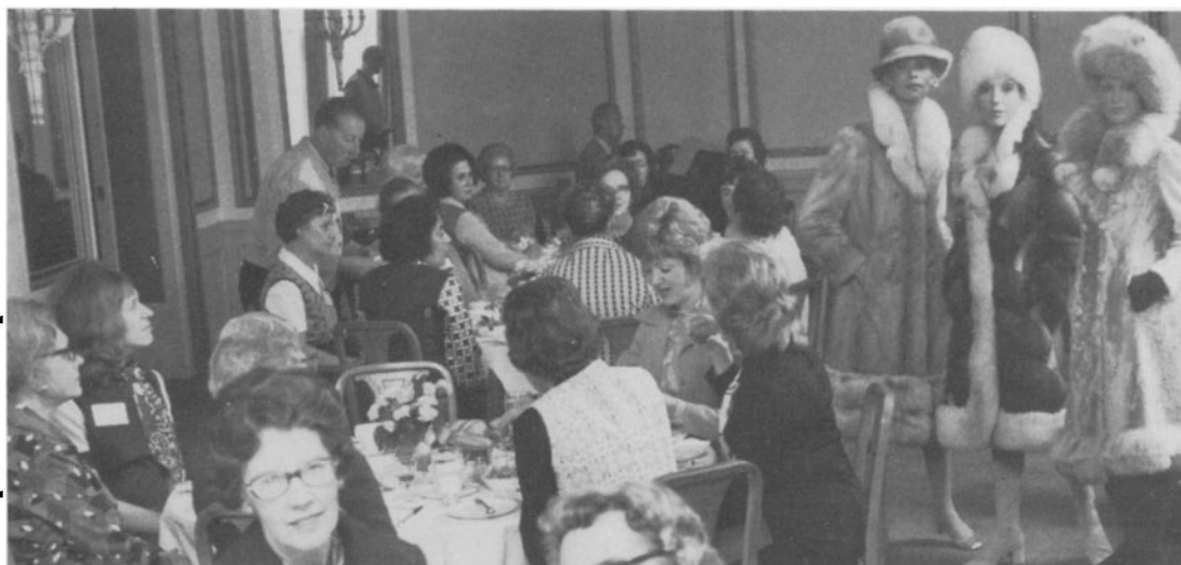
Participants in the program for AOCS spouses lunch in the presence of models sporting precious furs, part of a fashion show provided by the Hudson Bay Co.