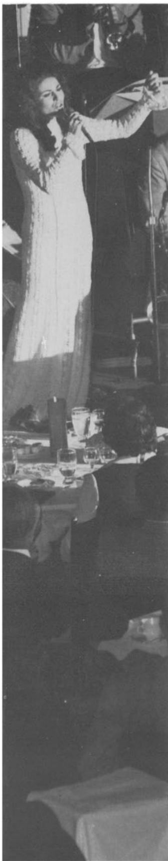
Singer Catherine McKinnon holds her audience with a rendition of one of the songs that have made her the largest selling female recording artist in Canada. McKinnon, along with actor Donald Harron, entertained at the Tuesday evening banquet.